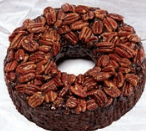
Cherry Fudge Pecan Cake