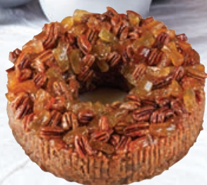
Pineapple Pecan Cake

"It is made just the way I like Christmas cakes to be, rich and moist, and totally packed with fruit and nuts - I am almost ashamed to say that I consumed one whole one myself - in the space of a week I hasten to add."