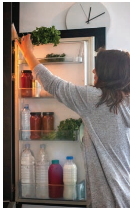
ZORAN MIRGETIC | ISTOCK.COM