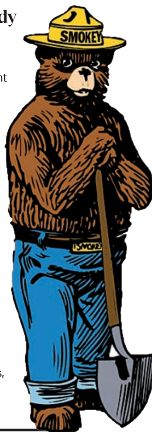
SMOKEY BEAR: COURTESY NATIONAL ASSOCIATION OF STATE FORESTERS