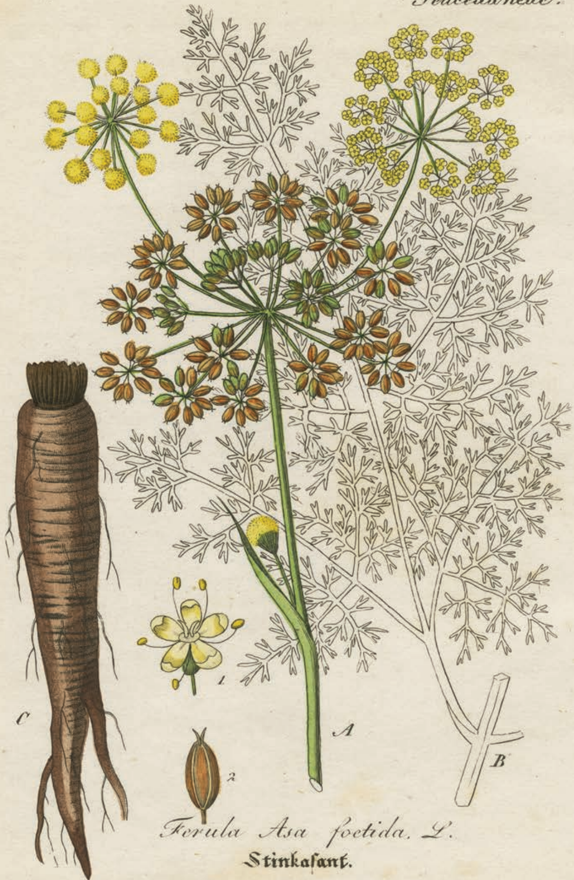
Ferula Asa foetida , L. Stinkasant.